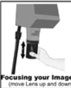
Focusing your Image (move Lens up and down)