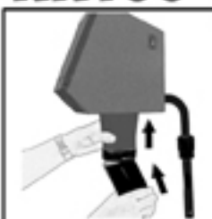
Inserting the Lens (Glass end UP for enlarging Down for Reducing)