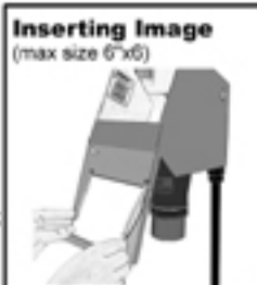
Inserting Image (max size 6"x6")