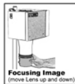
Focusing Image (move Lens up and down)