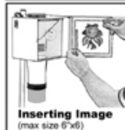
Inserting Image (max size 6"x6")